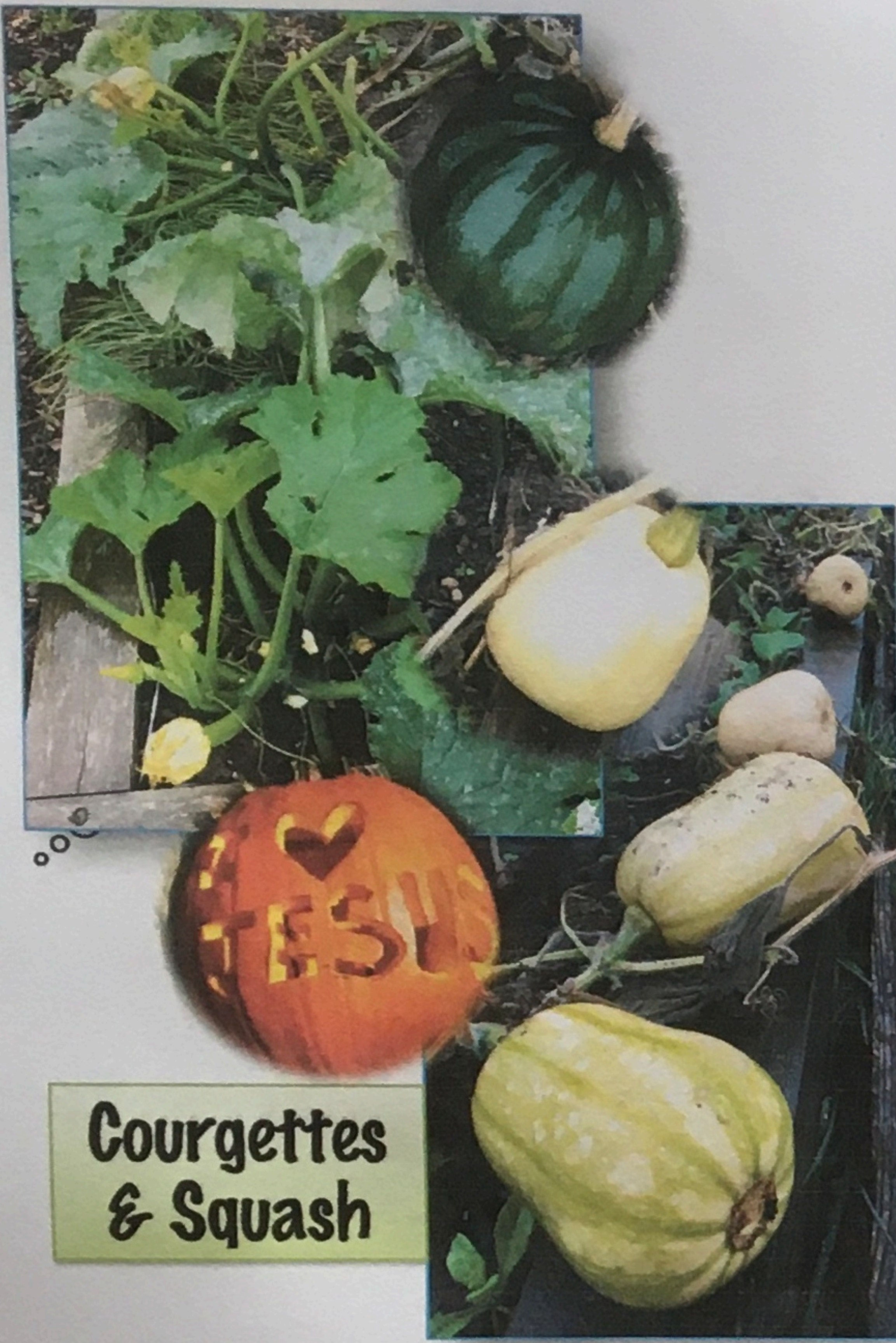
Courgettes & Squash