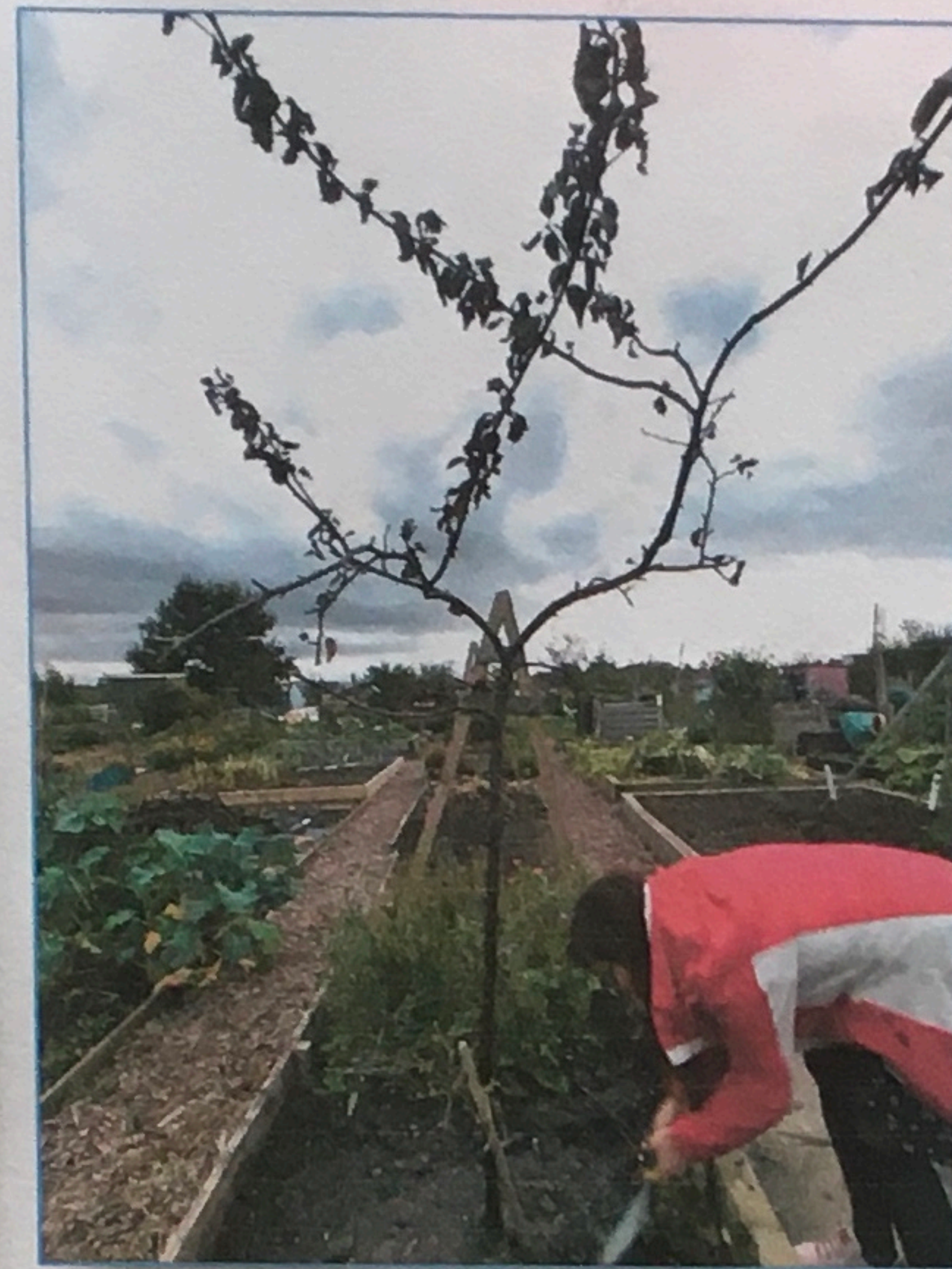
Apple Tree Planting