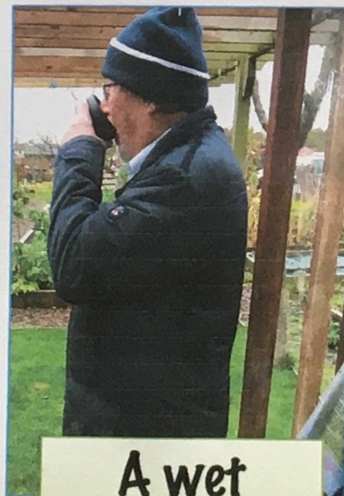
A wet session calls for coffee and planning!

GOD'S GROWINGS ~~~~~ Nov. 2021 Jottings 'Down2Earth'